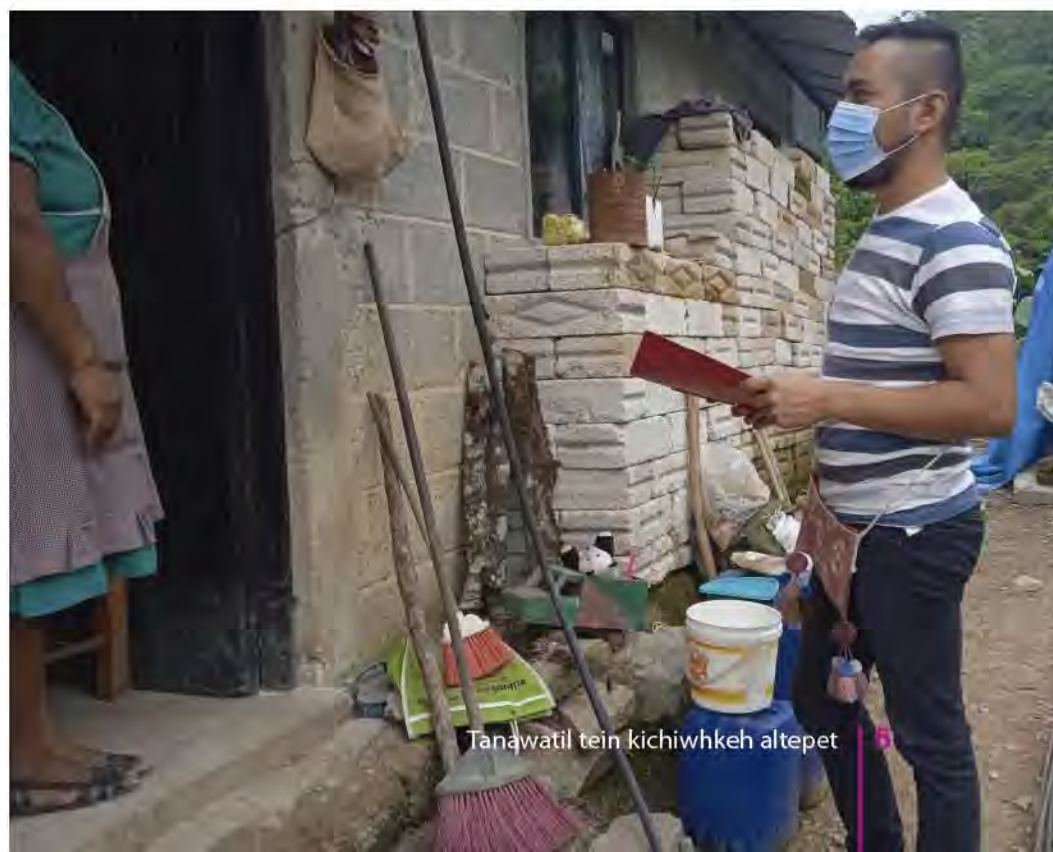
Tanawatil tein kichiwkeh altepet

Nehin siwameh tein techtapowihkeh, kaltekitchiwah, kipiah pilimeh wan nokipa-lewiah niwewetkeh ika tekit tech milah, kichipawah tepemeh, tatokah, kitsakah kowit wan ika nochi yin tein kichiwah amo kintaxtawiah, kipiah kichiaskeh mah takat tehsa kinmaka.